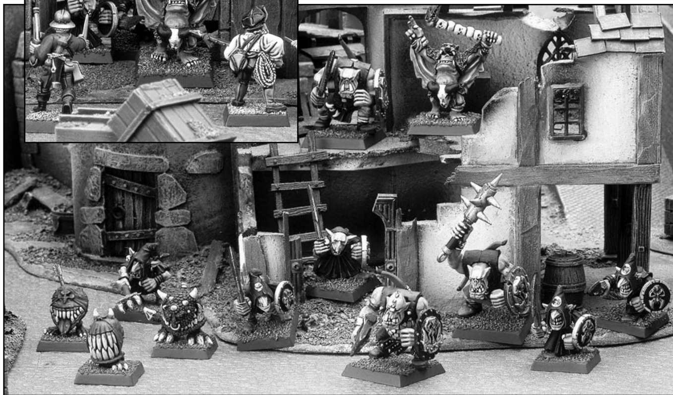
Thogskin leads his warband in search of booty and a big scrap.